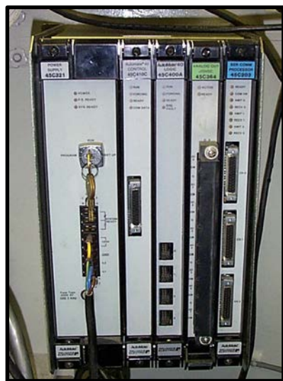
AutoMate 30 & 40

The new expansions were made to our existing AutoMate test stand. This test stand was completed by Shannon Hooker. The AutoMate is a small programmable logic controller. The AutoMate 15 & 20 are simple relay replacers with 4 function math and analog capabilities. They are compact with a built in power supply and I/O interface. The AutoMate 30 & 40 are modular but also boast ASCII, 3 levels of I/O, redundancy, and interrupt processing. Resource APX software and R-NET interface is used to communicate with other PLC's.